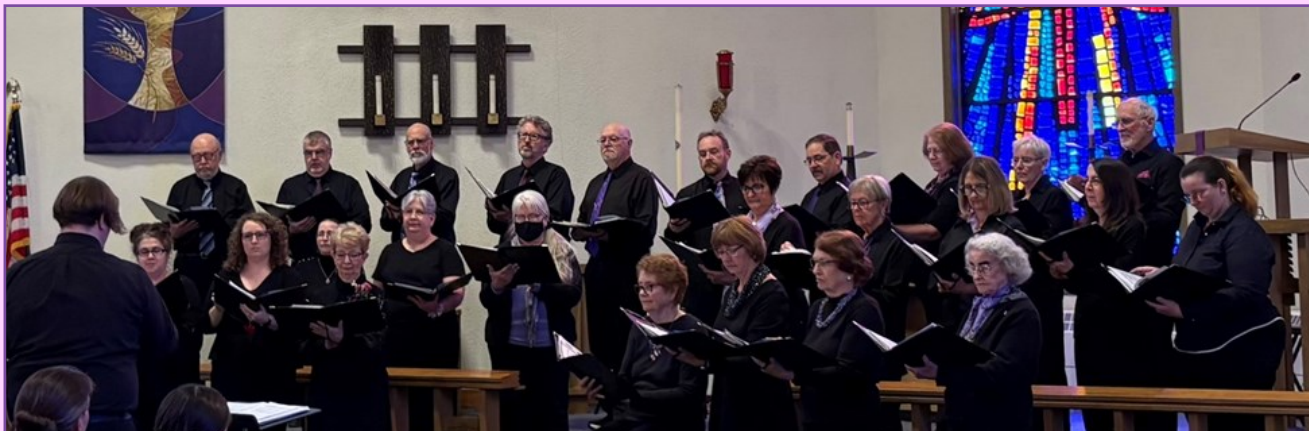
The Genesee Valley Choir held a concert here on March 23.